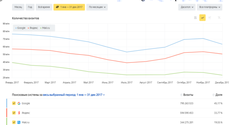
Figure 1 Number of visits [6]

In the second case we see the total suppression and superiority of Google. Along with that, we must remember that the data provided by Yandex, on the basis of its statistics service, which may not be installed on some sites [7]. Therefore, all figures given and used must be taken with a certain degree of skepticism.